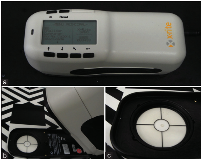
Figure 1: (a) Portable spectrophotometer (SP60 X-Rite, Grand Rapids, MI, USA); (b) Selection of a white background; (c) A sample of elastomeric ligature placed for color assessment

Data were analyzed with SPSS 20.0 software (IBM, Armonk, NY, USA). Intraobserver reproducibility was tested with intraclass correlation coefficient (ICC). The Shapiro-Wilk test attested that the data were not normally distributed for all dependent variables (L*, a*, b*, \Delta L , \Delta a , \Delta b , \Delta E_{ab} , and \Delta E_{2000} ). Variables L*, a*, and b* were compared between times (T1-T0) with Wilcoxon paired ranks; color changes ( \Delta L , \Delta a , \Delta b , \Delta E_{ab} , and \Delta E_{2000} ) were compared between groups (BP, C, WP,