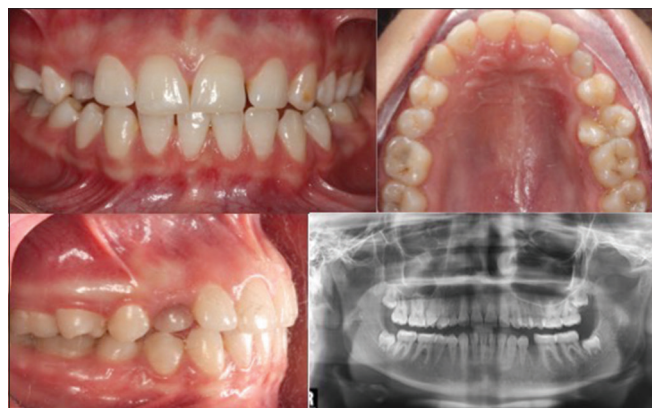
Figure 1: Preoperative image

As a result of intraoral and radiographic evaluations, it was determined that sufficient space of the ectopic canine which was present in the recipient area. Mobile primary tooth was pulled out, and the socket