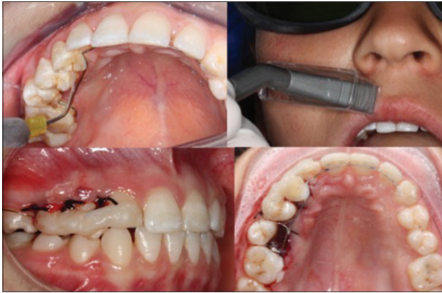
Figure 2: Intraoperative image

the observed time. [6] Because of this advantage, it is aimed to protect the bone for implant therapy even if resorption will be observed in the future.