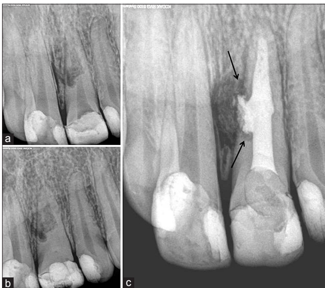
Figure 1: (a) Preoperative radiography of the case showing internal replacement resorption. Note the appearance of irregular enlargement at the middle third of the canal that was filled with a fuzzy material resembling the bone-like tissue. (b) Calcium hydroxide medication at 1-month follow-up. (c) After canal filling with mineral trioxide aggregate. Note the gaps between mineral trioxide aggregate and the resorbed root walls (arrows)

At the time of the 6- and 12-month follow-ups, organization of the periradicular tissues around the perforation site and progressive deposition of hard tissue between the MTA and the defect margins were seen, radiographically. The patient missed the 2-year follow-up. An orthodontist phoned for the consultation of the orthodontic treatment that was planned for the patient. During the 4-year follow-up examinations, the tooth was free of endodontic and periodontal symptoms. Radiographically, the gaps were seen as completely repaired with the deposition of hard tissue [Figure 2a]. After the completion of a year-long orthodontic treatment, all incisors were restored with full esthetic ceramic crowns by a prosthodontist due to the patient's complaints about the occurrence of discoloration in the tooth [Figure 3a and b]. The prosthodontist reported that a fiber post was bonded to the canal, and a composite core was built up. At 6-year follow-up radiographs, the healing with hard tissue repair resembling a barrier on the MTA and the organization of periodontal membrane adjacent to this hard tissue barrier were seen [Figure 2b].