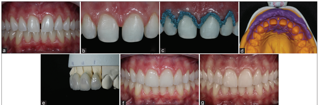
Figure 1: Photographs of the case (a) initial view; (b) completed teeth preparation; (c) gingival management with astringent retraction paste; (d) addition silicone impression; (e) laminate veneers; (f) final case; and (g) 2-year follow-up

Gingival management was performed using the astringent retraction paste (3M ESPE, St Paul, MN, USA), that was placed into the sulcus presented by a continuous line around the circumference of the teeth, and allowed to sit for 2 min [Figure 1c]. To wash the paste from the sulcus, water spray was used, followed by air-drying. The hemostatic property of the paste left the prepared tooth fully dry. Margins were inspected, and then, a final impression was taken using a one-step addition silicon technique Express XT and Light Body Paste (3M ESPE) and sent to the laboratory [Figure 1d]. Provisional restorations were done using Protemp™4 Temporization Material (3M ESPE, Seefeld, Germany).