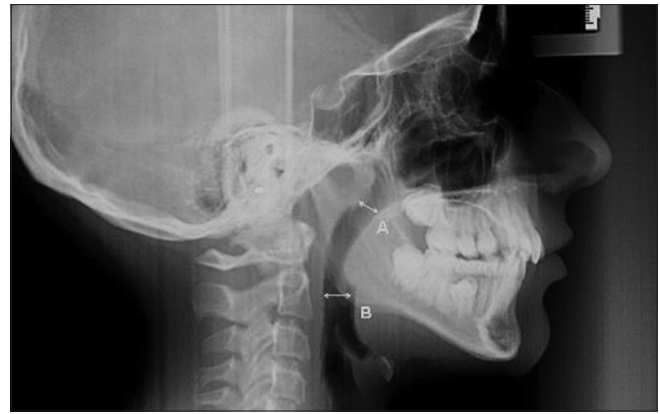
Figure 1: Digital lateral cephalogram showing distance of epiglottis from the tip of the soft palate (a) and distance of posterior pharynx from the tip of the epiglottis (b)

of the patients were, also, recorded at the time of eliciting the history whereas the resultant body mass indices were correlated with the parameters analyzed.