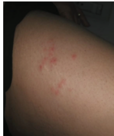
Figure 4: Anterolateral aspect of the right thigh of the 45-year-old female showing vesicular eruptions characteristic of herpes zoster