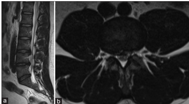
Figure 1: (a) Sagittal T2 weighted magnetic resonance imaging of the 30-year-old male showing mild disc bulge at L3-4 with mild compression of the nerve root on the right side (b) Axial T2 weighted magnetic resonance imaging of the 30-year-old male showing mild disc bulge at L3-4 with mild compression of the nerve root on the right side

In both cases, the initial diagnosis of discogenic pain was made based on clinical features corroborated by magnetic resonance (MR) image findings. The diagnosis was also confounded by the occurrence of rash following hot fomentation. If diagnosed, appropriate treatment can