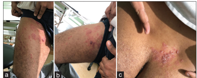
Figure 2: (a-c) Clinical picture of the 30-year-old male showing the classical vesicular eruptions on the anteromedial aspect of the thigh and right paraspinal region at posterior superior iliac spine