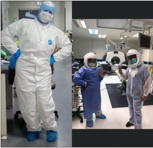
Figure 2: A staff nurse and a neurosurgeon dressed in the protective dress before preparing for surgery on a patient with intraventricular aneurysmal hemorrhage

time spent in the COVID-19 operating area. Anesthesia assistants should prepare everything while the patient is transferred to limit the time of contact with each patient.