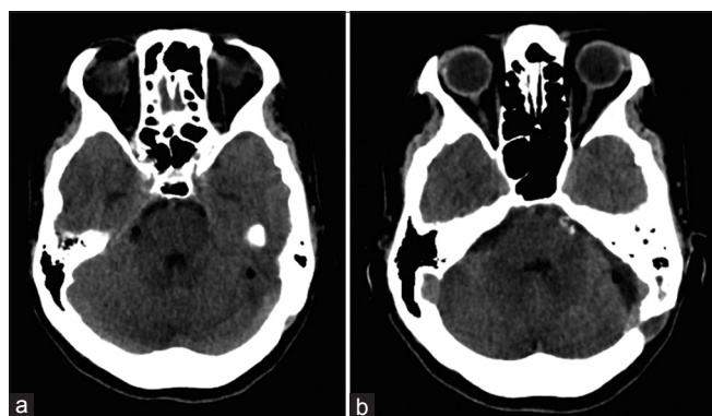
Figure 1: (a) Presence of air at the level of the cerebellum, and interpeduncular and crural cisterns and (b) Partial disruption of the posterior mastoid cells with left mastoid occupation, associated with a retrosigmoid bone defect

During the surgical procedure at the opening of mastoid cells, a cyst with CSF in its interior was found in the left retrosigmoid region. Cell sealing was performed using bone wax; dura mater was covered with fat and muscle grafts, in combination with primary anatomic closure of the