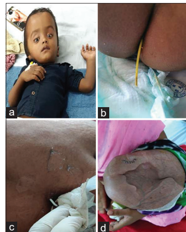
Figure 2: (a) A child with progressive hydrocephalus showing increased head size and sunset sign; (b) Shunt migration and per rectal appearance in a child; (c) Distal ventriculoperitoneal shunt catheter extrusion in right hypochondrial region; (d) Top view of head of an infant with shunt over drainage resulting in sunken fontanel

Aqueductal stenosis ( P = 0.0445 ), DWM ( P = 0.0022 ), and GMH ( P = 0.0019 ) as an etiology to PH were significantly more in the age group of \leq 1 year [Table 5]. Psychosocial morbidity was significantly ( P = 0.0015 ) more in age groups 1–6 years and 6–12 years [Table 5]. There was no significant difference ( P > 0.05 ) in terms of shunt complications, ETV failure, neurological morbidity, and mortality between the three age groups [Table 5].