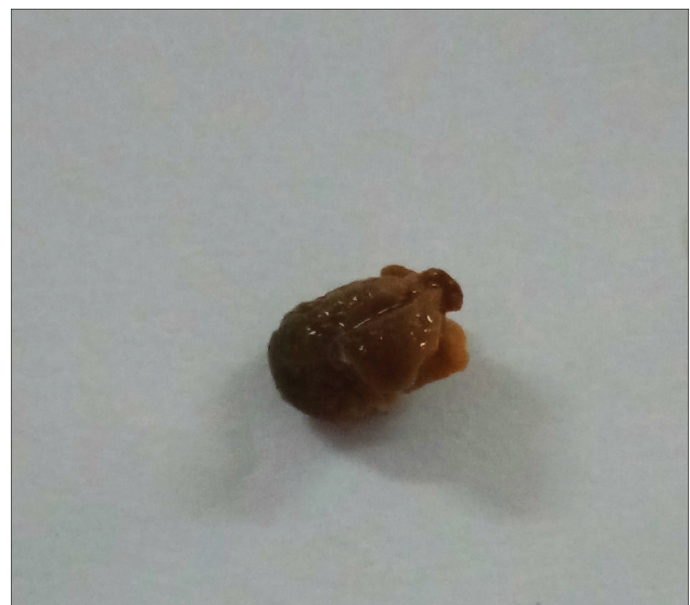
Figure 4: Expectorated tumor tissue