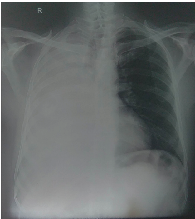
Figure 1: Chest X-ray PA view showing diffuse homogenous opacity without air bronchogram on right lung field

The expectoration of tumor tissue, also suggested to be called oncoptysis, histoptysis, or carcinoptysis, is a very unusual event, although it has been reported since 1886. [2] Only 30 cases of such types were reported till 2012 as elaborated by Ochi