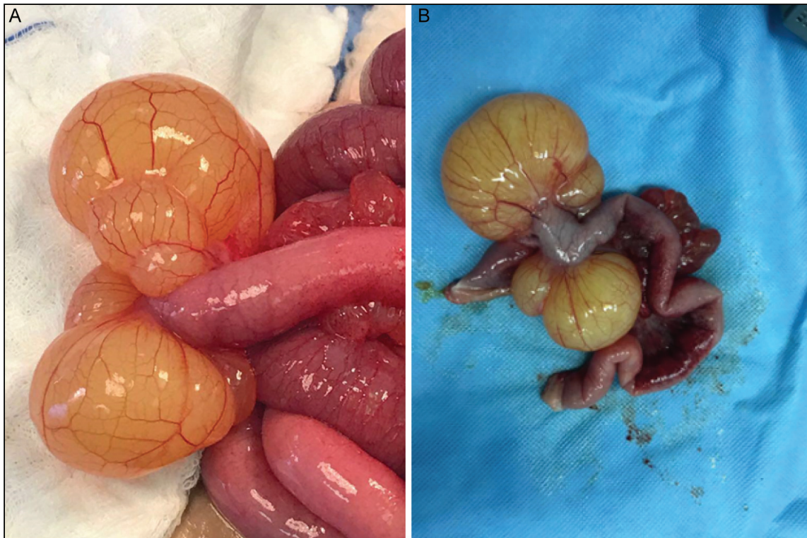
Figure 3: (A) Photo showing the cystic lymphangioma causing the volvulus. (B) Photo showing the lymphangioma and the affected bowel after resection