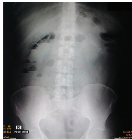
Figure 1: Erect abdominal X-ray of a patient in this series. Air–fluid levels can be seen in the upper abdomen with scarce abdominal gas in the lower abdomen. It may be difficult to distinguish these findings from mechanical bowel obstruction

All patients were well in the follow-up visit 1 week after discharge, and no patient presented again for the recurrence of symptoms within the study period.