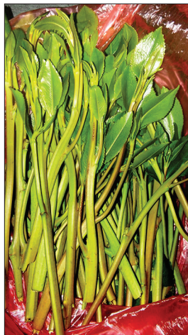
Figure 2: The shiny leaves of the qat plant are prepared by rinsing and cleansing before they are left to dry. The leaves are picked out from the thick branches, chewed well, and packed under the cheek for hours

Qat was heavily studied for its negative effects on teeth and mouth hygiene. The prolonged use can also lead to cardiovascular disease, cytotoxic effects on the liver and kidney, and mental illness and psychosis. [1] The economic burden of qat consumption is also substantial, as some Yemeni citizens waste more than 50% of their income on qat. Because of worldwide smuggling, qat consumption can