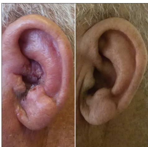
Figure 1: The lesion before therapy and after 8 months