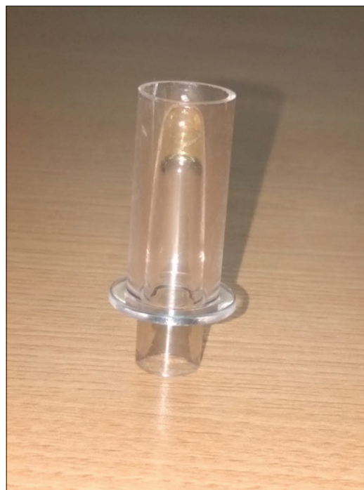
Figure 1: The serum sample transformed into a semisolid material after incubation with Vitamin D reagents

The following day, the same patient's sample was received in a gel-containing Vacutainer (yellow top tube) for the estimation of liver function tests (LFTs). After centrifugation, it was noted that serum sample was sandwiched between the clot and the floating gel. This suggested that the patient may be a case of paraproteinemia. Hence, a request was being made to collect the sample in a lithium heparin tube (light green