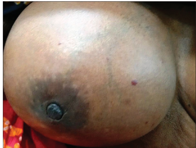
Figure 1: The breast lump with glistening of skin and venous prominence

Myeloid sarcoma presenting as a breast mass is uncommon. [1-3] An extensive search of the previous literature revealed 67 previously reported cases, of which 66 occurred in women and one case occurred in man. Thirty-seven of these previously reported cases are tabulated in Table 1, with a wide age range of 16–72 years [Table 1]. Very few cases have been reported as an isolated mass with no significant history or subsequent development of AML while on clinical follow-up. [4] All the patients presented as asymptomatic breast mass either detected by self-examination or by mammographic studies. Right breast involvement is more common than the left while single case has been reported which was bilateral. The cases usually present with a lump and may be associated symptoms pain, but nipple inversion and discharge are usually absent. [4,5] In our case, it was a solitary firm breast lump without pain, nipple change, and secretion.