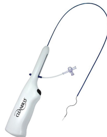
Figure 1: Cleaner rotational thrombectomy device