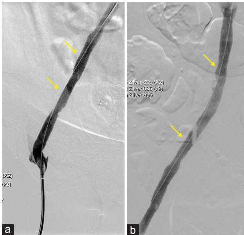
Figure 3: (a and b) Final venogram postangioplasty and stenting demonstrated restored single-vessel outflow through the right iliofemoral system (arrows) and patency of the iliofemoral stents

iliofemoral veins with marked reduction in edema and pain secondary to postthrombotic syndrome.