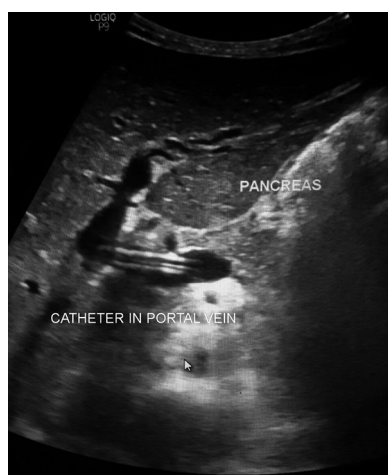
Figure 3: Ultrasound image showing the tunneled catheter in the portal vein

peel-away sheath. Heparinized normotonic saline was injected into the catheter to avoid thrombosis, and the patient was sent for dialysis same day of the catheter application. Hemodialysis was resumed and maintained