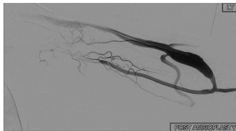
Figure 3: Digital subtraction angiography of the left brachiocephalic fistula postangioplasty at the end of the procedure showing improvement in the morphology of the fistula

Naif Abdulaziz Alanazi 1,2 , Mohammed Saeed Altolub 1,2 , Nasser D. AlHendi 1 , Yusof A. Al Zahrani 1 , Mohammed Arabi 1