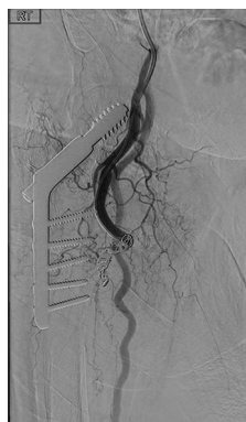
Figure 4: Digital subtraction angiogram of the right profunda femoris artery postcoiling embolization of the arteriovenous fistula

How to cite this article: Abohmed AB, Al Zahrani YA, Al Dulagain EM, Al Moaiqel MI. Arteriovenous fistula of the profunda femoris artery postdynamic hip screw fixation. Arab J Intervent Radiol 2018;2:93.