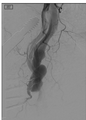
Figure 3: Digital subtraction angiography of the right profunda femoris artery showing opacification of the femoral vein consistent with an arteriovenous fistula

This is an open access journal, and articles are distributed under the terms of the Creative Commons Attribution-NonCommercial-ShareAlike 4.0 License, which allows others to remix, tweak, and build upon the work non-commercially, as long as appropriate credit is given and the new creations are licensed under the identical terms.