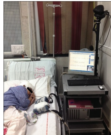
Figure 2: Continuous electroencephalography monitoring

To facilitate the interpretation of cEEG, digital trend curves based on various signal characteristics can be