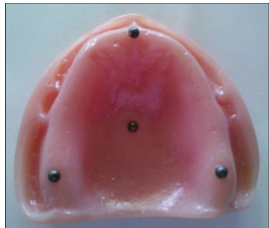
Figure 3: Chemically-activated acrylic resin master mold

With the aid of a coordinate-measuring machine (Brown and Sharpe), the reading of the acrylic resin master mold