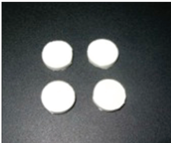
Figure 2: Dental stone samples

Type IV dental stone was mixed according to the proportion recommended by the manufacturer and poured into the perforations of the matrix so that the plate was kept onto a dental stone vibrator during this procedure. After the material setting, the dental stone pastilles were removed from the device and subjected to the mean roughness analysis [Figure 2].