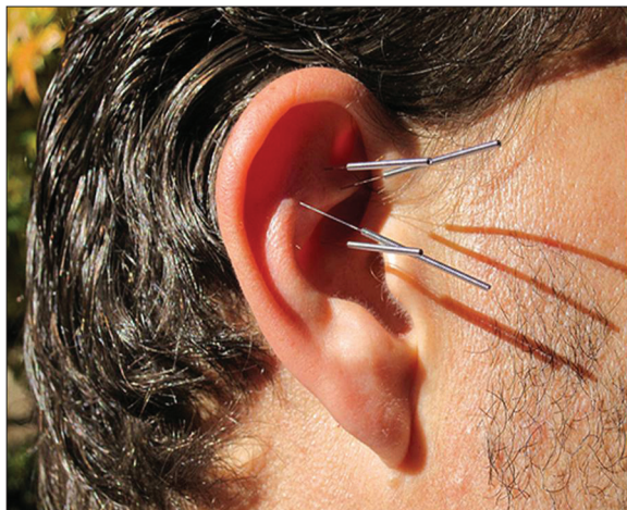
Figure 1: Acupuncture controlling ear pain

Acupuncture analgesia works better than a placebo for most kinds of pain, and its effective rate in the treatment