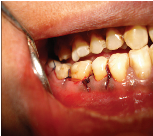
Figure 7: Sutures placed