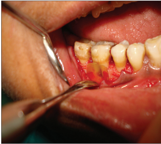
Figure 5: Size determination before GTR placement