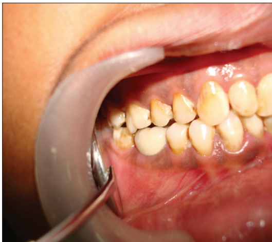
Figure 9: Post-operative view of tooth 46