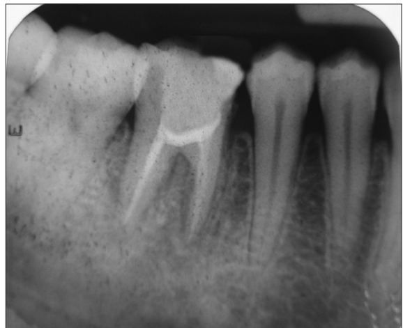
Figure 10: Post-operative IOPA X-ray

not considered totally predictable, especially in terms of a complete bone fill. Many factors may account for variability in the response to regenerative therapy in class II furcation. Novaes and Novaes [5] have reported eight different situations of class II furcations in which GTR is