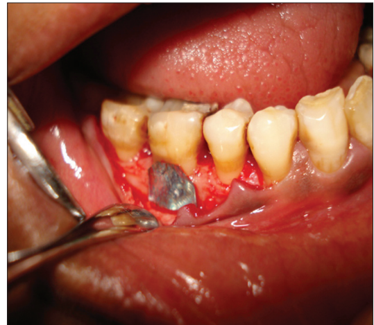
Figure 4: Foil placed to determine size of GTR