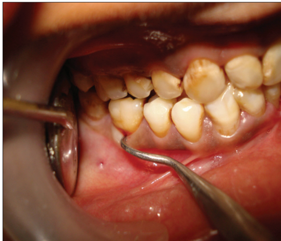
Figure 1: Pre-operative view of tooth 46

Regeneration of periodontal hard and soft tissues, including formation of a new attachment apparatus is the main aim of regenerative therapy. Traditional approaches to treat periodontal and endodontic defects, include, nonsurgical debridement of root surfaces or root canals, as well as surgical approaches that provide better access to clean the root surfaces and apical lesions, and to reshape the surrounding bone / root apex. Bone loss caused by pulpal disease is reversible, whereas, advanced bone loss caused by periodontal disease is usually irreversible. The necessity of periodontal surgical therapy is most likely because the periodontal bone loss was more advanced and less likely to resolve after non-surgical therapy alone. [1] However, periodontal regeneration in furcation defects, although possible, is