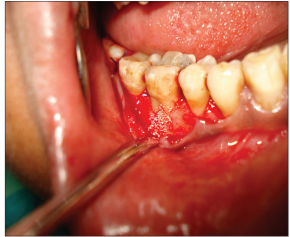
Figure 6: Bone graft placed