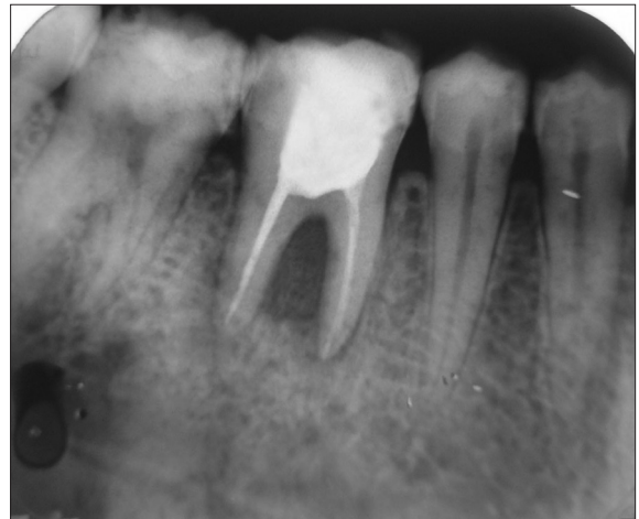
Figure 2: Pre-operative intra oral periapical (IOPA) X-ray