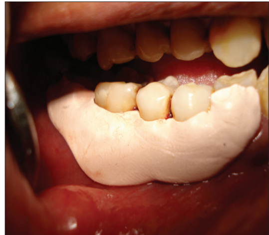
Figure 8: Periodontal dressing