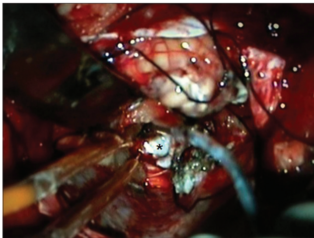
Figure 3: Intraoperative image showing the pearly white appearance of the epidermoid (*) seen after removal of the schwannoma

cysts and trigeminal, and VIII nerve schwannomas with contralateral epidermoids and cholesterol granulomas. [4-7]