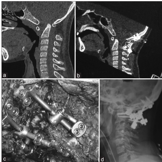
Figure 1: (a) Severe atlanto-axial dislocation with basilar invagination; (b) following reduction after the author's technique (distraction, compression and extensive Reduction); (c and d) Utilisation of 2 pars screws along with 2 laminar screws to enhance the strength of the cervical screws

Providing active intraoperative compression between the C2 trans-laminar screw heads and a temporary screw placed on the occiput provides an additional movement of extension, which is important to correct AAD. Distraction alone may correct the AAD to a great extent