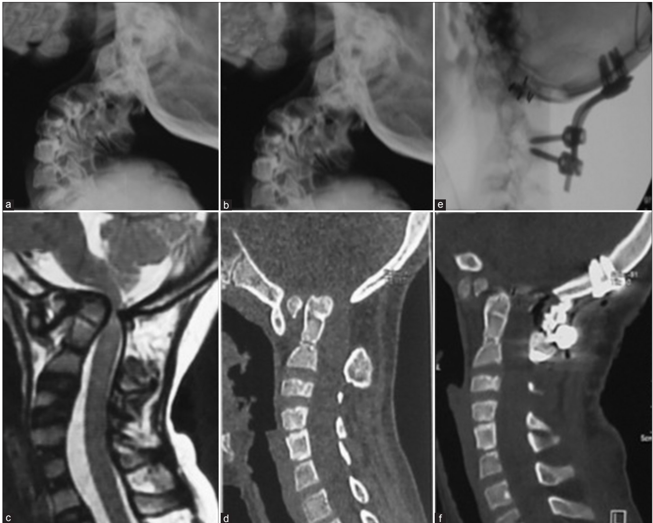
Figure 2: (a-d) Patient with basilar invagination (BI) and atlanto-axial dislocation with a small os-odontoideum. Following the author’s technique distraction, compression and extensive reduction, the dens has shifted inferiorly below the os-odontoideum correcting the BI and also has moved anteriorly also correcting the AD (e and f)

There are certain clival segmentation anomalies, where the entire clival-dens complex is bulky; hence a trans-oral procedure may be the only option.