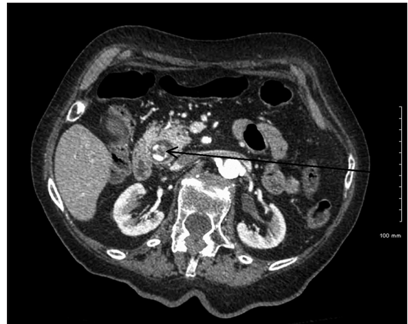
Figure 1: Transverse section from a Computed tomography scan of the abdomen showing a stone in the common bile duct. Arrow pointing to the stone

who got ERCP, calculating incidence of 2.24%. The most common organisms were Enterobacteriaceae (29%) followed by Enterococci (22%).