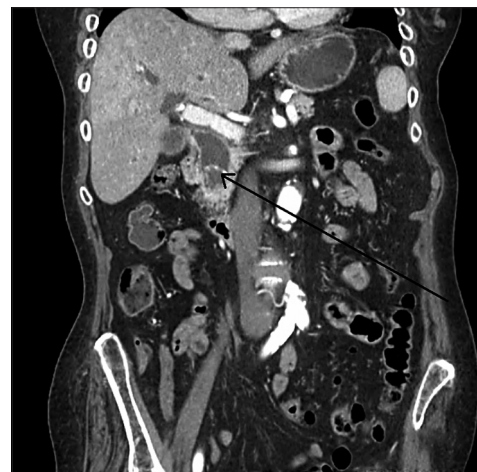
Figure 2: Coronal section from a Computed tomography scan of the abdomen showing the same stone in the common bile duct. Arrow pointing to the stone