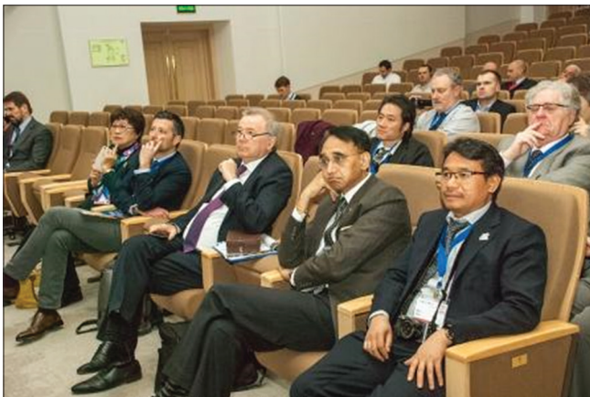
Figure 12: WFNS Educational course in conjunction with the 4 th ISMINS Congress in Moscow on 19–21 April 2018