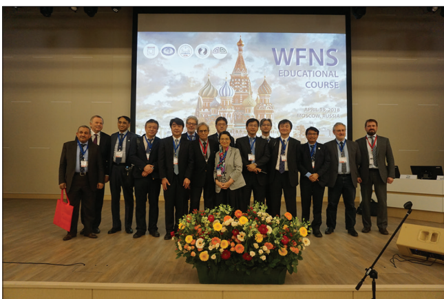
Figure 14: WFNS Educational course in conjunction with the 4 th ISMINS Congress in Moscow on 19–21 April 2018