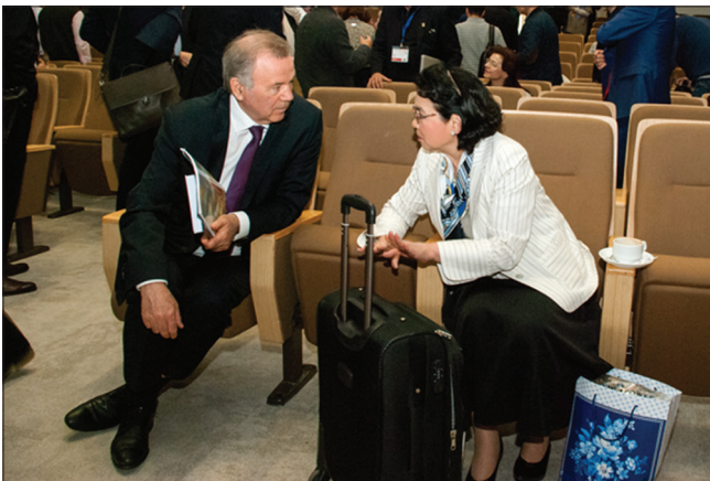
Figure 6: WFNS Educational course in conjunction with the 4 th ISMINS Congress in Moscow on 19–21 April 2018