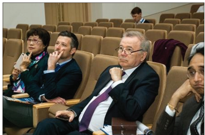
Figure 13: WFNS Educational course in conjunction with the 4 th ISMINS Congress in Moscow on 19–21 April 2018