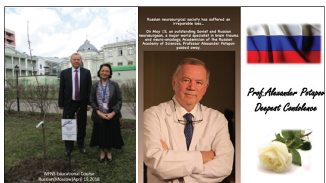
Figure 15: WFNS Educational course in conjunction with the 4 th ISMINS Congress in Moscow on 19–21 April 2018 (Left) and obituary message adopted from the https://www.wfns.org/news/230/obituary-professor-alexander-potapov (Right) [27]