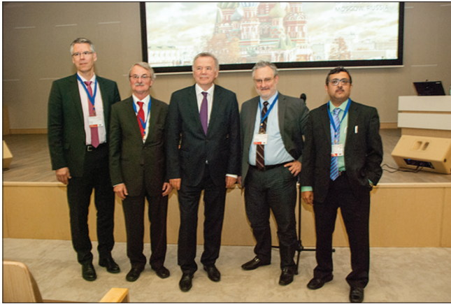
Figure 10: WFNS Educational course in conjunction with the 4 th ISMINS Congress in Moscow on 19–21 April 2018