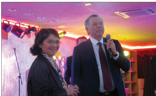
Figure 3: International Neurosurgery Forum: WFNS Education Course. Conference “Sport and Neurotrauma” in Sochi, Russia on 26–27 February 2016

He was the chairman of the Scientific & Organizing Committee. Many distinguished faculty members attended