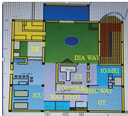
Figure 1: Setup of intraoperative magnetic resonance imaging, operation theater, computed tomography scan, and Intensive Care Unit

General anesthesia was given at P3 level, and skin marking was given with the help of MRI contrast guidance. Craniotomy flap or the laminectomy was done, and the dura opened in the similar fashion by the same instruments as for the nonIMRI case. Rubber bands made from the gloves were used, where ever retraction was needed and stitched to draping. Corticectomy is planned after the T1 contrast image to localize and minimize the cortical resection. From P3 to P1 and vice versa, the patient was taken in multiple session to excise the tumor to around 0.5 mm of margin for radiotherapy [1] according to T1 contrast axial, coronal, and sagittal views, so that the resection is optimized and maximized. Immediate preclosure hematoma and edemas can be differentiated and cared for it.