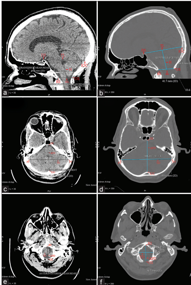
Figure 1: (a) Brain computed tomography midsagittal film demonstrating the boundaries of posterior fossa. (b) Brain computed tomography midsagittal film (bone window) demonstrating the measurement of height of the posterior fossa. DS – Dorsum sellae; IOC – Internal occipital crest; TL – Twining’s line; BS – Basion; OS – Opisthion; ML – McRae’s line; H – Height of posterior fossa. (c) Brain computed tomography axial film demonstrating anteroposterior and transverse diameters of posterior cranial fossa. DS – Dorsum sellae; IOC – Internal occipital crest; PT – Base of Petrous temporal; APD – Anteroposterior diameter; TD – Transverse diameter. (d) Brain computed tomography axial film (bone window) demonstrating the measurement of anteroposterior and transverse diameters of posterior cranial fossa. (e) Brain computed tomography axial film demonstrating anteroposterior and transverse diameters of foramen magnum. (f) Brain computed tomography axial film (bone window) demonstrating the measurement of anteroposterior and transverse diameters of foramen magnum. BS – Basion; OS – Opisthion; APD – Anteroposterior diameter; TD – Transverse diameter

to 70 years with a mean of 41.22 \pm 13.937 years [Table 1]. There were 53 males and 47 females. Patients with fracture of base of the skull and with soft tissue injuries including brain parenchyma were excluded from this study. The dimensions such as height, AP, and transverse diameters and PFV were measured in the CT scans and were depicted in Table 2. The AP, transverse diameters, and the surface area of FM in the CT scans were enumerated in Table 3. There was no significant difference in the dimensions of posterior fossa and FM among the various age groups. Almost all the dimensions of PCF and FM were larger in males compared to females. These differences were statistically significant in all except AP diameter of FM [Table 4]. The mean height of PCF was 38.08 (\pm 4.718) mm (range 37.16–38.96 mm), and the mean PFV was 157.23 (\pm 6.700) mm 3 , (range 155.89–158.59 mm 3 ) in the CT scans of head injury patients. The mean AP, transverse diameters, and mean surface area of FM were 33.13 (\pm 3.286) mm, 29.01 (\pm 3.081) mm, and 763.803 (\pm 138.276) mm 2 , respectively. A Whisker-Boxplot