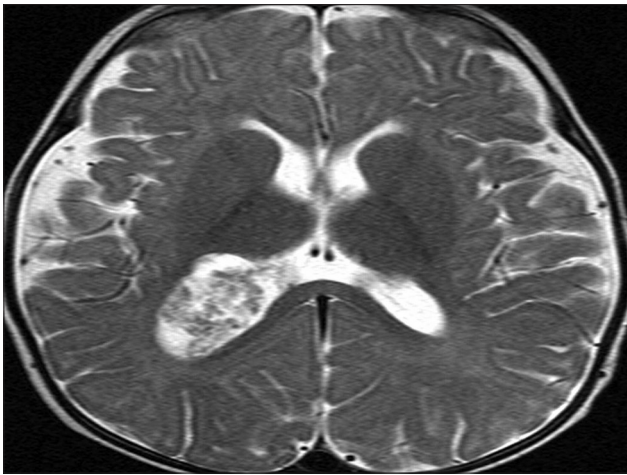
Figure 1: The magnetic resonance imaging of the brain revealing a large mass in the posterior horn of the right lateral ventricle attached by a pedicle