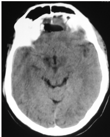
Figure 1: CT scan of head in axial plane showing pneumocephalus involving both frontal lobe