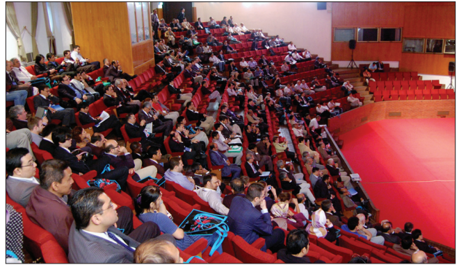
Figure 2: Meeting hall