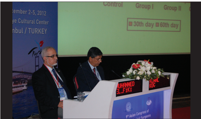
Figure 3: Moderators