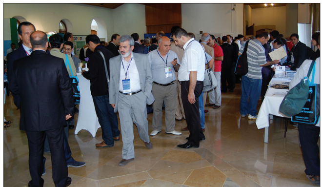
Figure 4: Coffee break