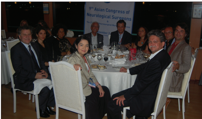
Figure 21: Gala dinner 5