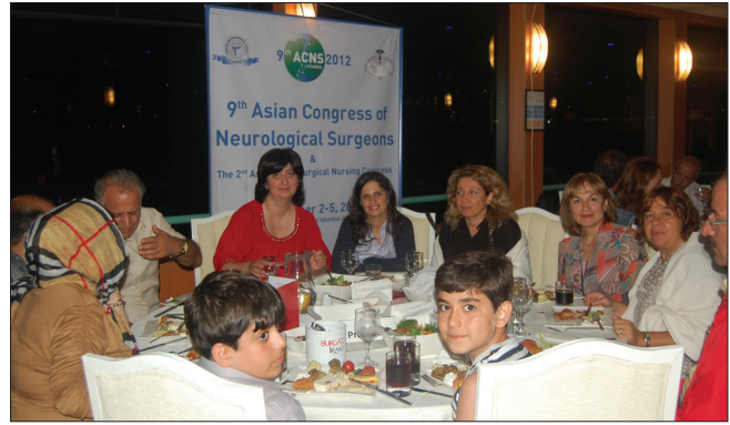
Figure 20: Gala dinner 4