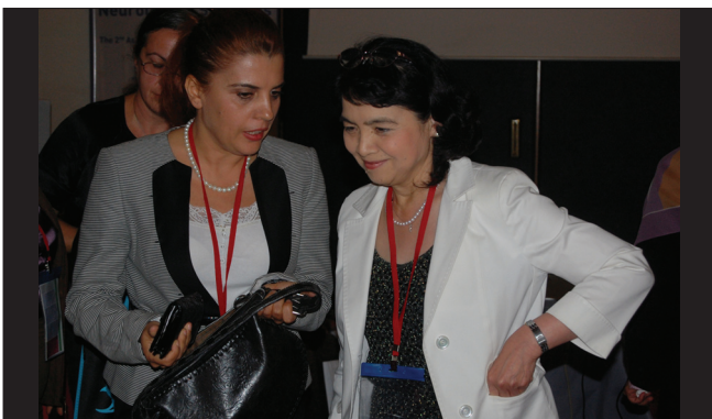
Figure 7: Asian Women's Neurosurgical Association