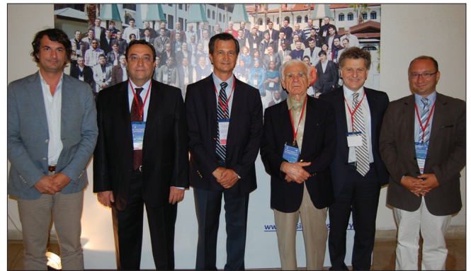
Figure 12: Yasargil and Turkish team