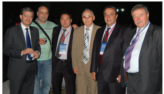
Figure 14: Opening reception-1