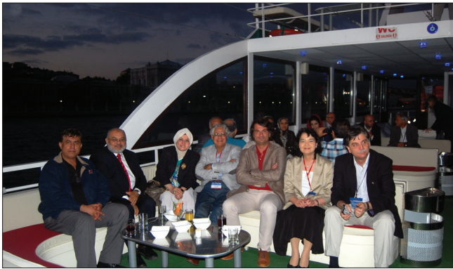
Figure 19: Gala dinner 3