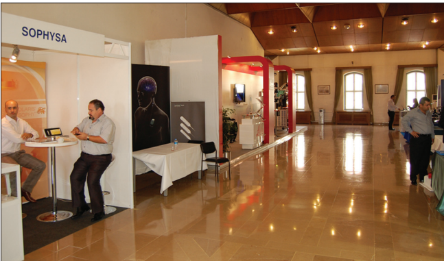
Figure 5: Exhibitors