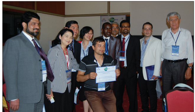
Figure 6: Young neurosurgeons