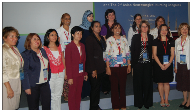
Figure 8: Nurses