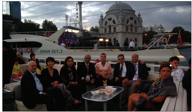
Figure 18: Gala dinner 2