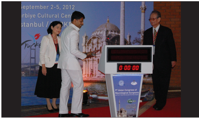
Figure 9: Tetsuo Kanno Award