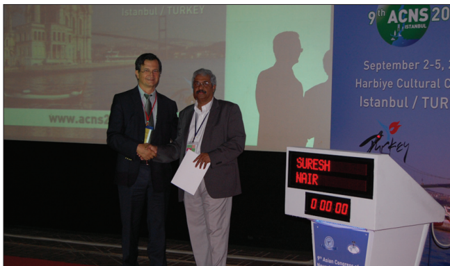
Figure 11: Best paper award