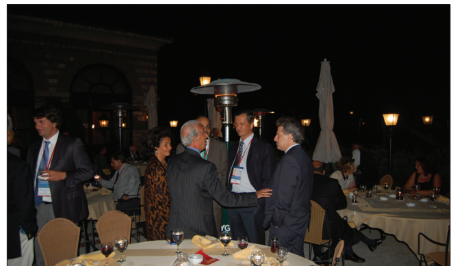
Figure 16: President's dinner