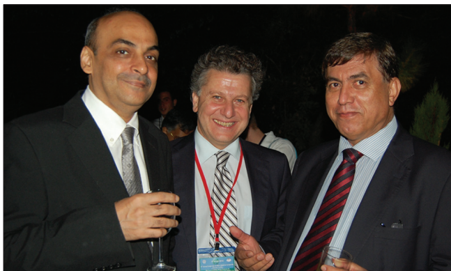
Figure 15: Opening reception-2