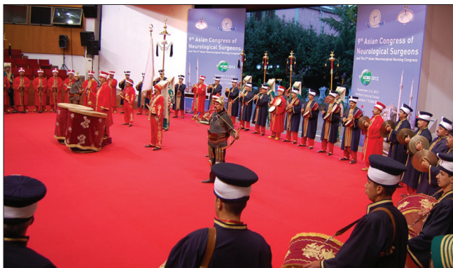
Figure 13: Mehter group