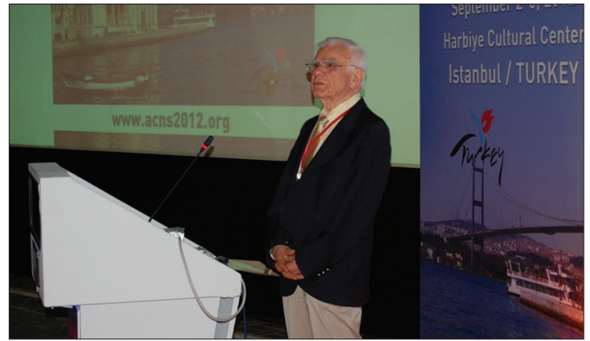
Figure 10: Professor Gazi Yasargil