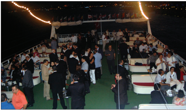
Figure 17: Gala dinner 1