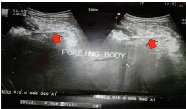
Figure 1: Ultrasonography upper abdomen - red arrows showing datun (wooden chewing stick) in stomach

depends on its chemical property, size, location, and sharpness. Ingestion of long foreign body is not common but not rare. Long foreign body may get impacted at three anatomical narrowings of esophagus and stomach, and it may lead to perforation. Due to its fixed retroperitoneal position of duodenum foreign body >5 cm in length and >2.5 cm in diameter has difficulty in passage through it. [7]