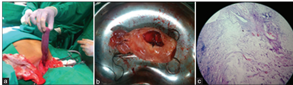
Figure 2: (a) Image of the polypoid lesion extracted through cervical incision. (b) Gross image of polyp after excision measuring 15 × 7 cm. (c) Histopathology of polyp showing fibrous tissue, vascular structures with normal stratified squamous epithelium