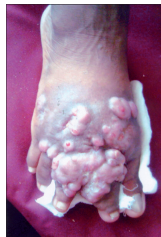
Figure 1: Photograph of lesion

The histopathological examination of biopsy revealed structure of skin, sub-cutaneous tissue and sinus tract lined by granulation tissue. Few irregular lobulated light basophilic granules were present. The granules are not bordered at the periphery by the eosinophilic material; the filaments in the granules are weak acid fast giving an impression of multiple discharging sinuses of foot – Actinomycetes Mycetoma – Nocardia species.