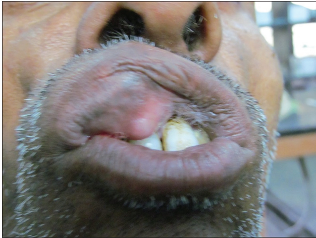
Figure 1: External clinical photograph. Cystic mass in the upper lip

Histologically Meyer divided the cysts of the floor of mouth into three categories: Epidermoid cysts, true dermoid cysts and teratoid cysts. [8] In the epidermoid cysts, the cyst cavity is lined by squamous epithelium without skin appendages, while the true dermoid cyst contains skin appendages such as hair, hair follicles, sebaceous and sweat glands etc., Cyst is defined as teratoid when in addition to skin appendages other tissues such as muscle, bone, cartilage etc., are present. Although typical dermoid cyst is a distinct entity, all above mentioned three types of cysts generally mentioned as dermoid cyst. The most common sites of dermoid are ovaries and testicles (80%), with head and neck accounting for only 7%. [1,2] Epidermoid and dermoid cysts are uncommon in the mouth and comprises less than 0.01% of all the oral cysts. [9]