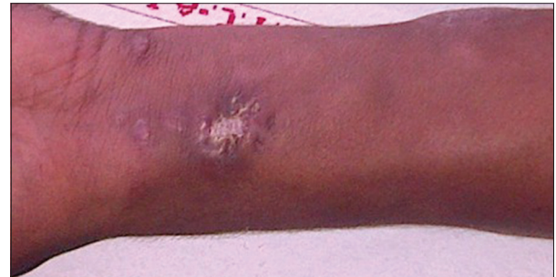
Figure 1: Photograph showing multiple ulcers and nodules over the forearm

A 15-year-old male child presented to our tertiary care trauma center with multiple non-healing ulcers on the left forearm since 2 months following trauma by a sharp object [Figure 1]. His general physical examination was unremarkable with stable vital