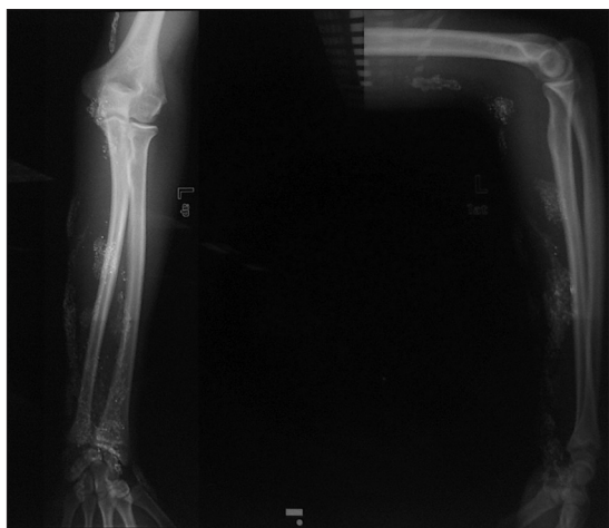
Figure 2: X-ray (anteroposterior and lateral views) showing multiple subcutaneous radioopaque deposits