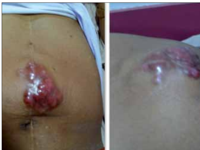
Figure 1: Scar recurrence at anterior abdominal wall