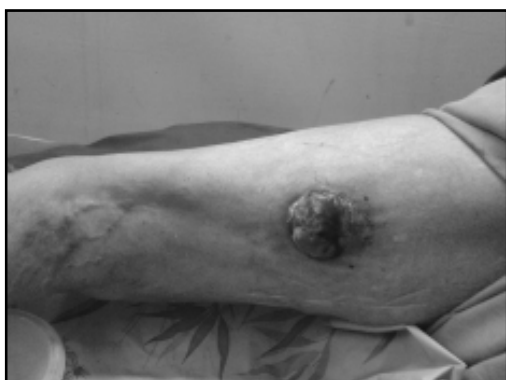
Fig 1: clinical photograph showing left thigh nodular ulcerated growth

CASE A sixty five year old frail lady presented with a left mid thigh swelling measuring 4 x 4 cms in posterior aspect of six months duration. The growth was proliferative and bled on touch (Fig 1). There were multiple left inguinal nodes measuring two to three cm. Biopsy from the growth revealed a malignant small round cell