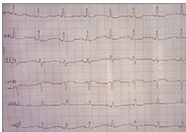
Figure 1c: Serial electrocardiograms