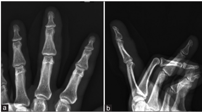
Figure 5: (a and b) Follow-up X-ray showing concentric reduction

concluded that volar plate interposition was the culprit in closed injuries while the buttonholed profundus tendon caused irreducibility in open injuries. This has been later contested by Banerji et al. in their report. [7] We also feel that, in our case, the displacement of the tendon was the primary impediment to reduction rather than the volar plate interposition. However, this interposition has to be identified and corrected before any attempt at joint reduction is made. Otherwise, it may become impossible to repair this structure post-reduction.