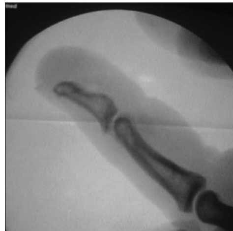
Figure 4: Concentric reduction of the joint on lateral view with image intensifier