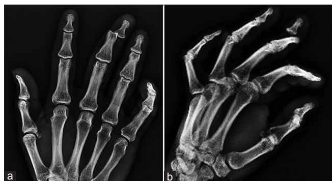
Figure 1: (a and b) X-ray views showing dorsoulnar distal interphalangeal joint dislocation with increased joint space

In a report and review of literature, Abouzahr and Poblete [6] found only 12 such cases reported till 1997 having included both open and closed dislocations. They