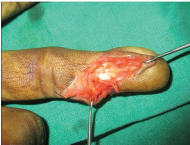
Figure 3: Intraoperative picture post-reduction with centralised profundus tendon