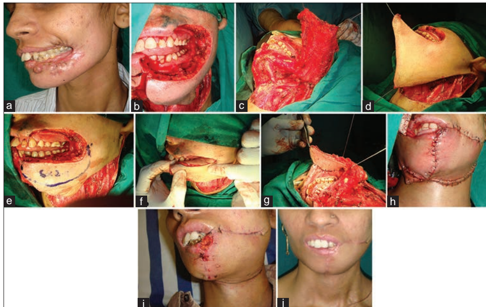
Figure 2: (a) A case of recurrent carcinoma of buccal mucosa and cheek with unreconstructed defect. (b) Same in front view, excision up to retromolar region. (c) The upper neck – lower face skin flap completely lifted up off the mandible, which removes any possible regular platysma blood supply. (d) The same upper neck – lower face skin flap, a donor site, external view. (e) The island flap created at the upper and anterior border of the above flap, just below the defect. (f) The island flap turned into create buccal lining. (g) The turned in part inset into the defect for the buccal lining. (h) Post-reconstruction external view, see tip congestion. (i) Wound dehiscence, not necrosis, at the lower lip. Maybe one can avoid anterior part of the incision in the flap which reconstructed the lower lip. (j) Following complete healing. Six months post-operative

from retromolar region upto lip involving partial loss of right upper lip, lower lip, commissure and part of cheek [Figure 3a and b]. A flap of 4.75 cm × 11 cm length was raised at the lower border of the upper cervical flap from the angle of mandible to the chin [Figure 3c]. The island was demarcated and incised, only dermis deep, at the upper border. The subdermal dissection was then carried out up to about 1.5–2 cm upwards at the upper border [Figure 3d]. Both anterior and posterior subdermal pedicles were divided to keep about 50% of the central width of the pedicle. The flap was then turned in over the mandible [Figure 3e]. The posterior end was stitched to the retromolar defect. The lower border of the flap was stitched to the upper edge of the defect and upper border at the lower edge of the defect till the commissure [Figure 3f]. At the commissure, as seen two vertical cuts were made at upper and lower borders up to the dermis [Figure 3g]. A subdermal dissection was carried out up to 5 mm under both the edges to create cut edges for mucosa and the skin of the lips. A central undivided portion mimicked the commissure. Then the flap was turned outwards and back from the lip edge to fill the outer defect [Figure 3h and i]. The flap was sutured. Patient received full course of radiation, and the flap survived and the patient is tumour free [Figure 3j and k].