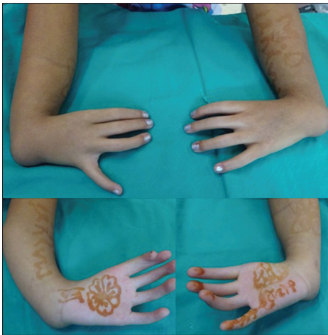
Figure 2: Case of bilateral radial club hand

CTEV: Congenital talipes equinovarus, U/L: Unilateral, B/L: Bilateral, RCH: Radial club hand