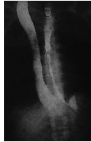
Figure 2: Barium swallow at the end of reconstruction showing smooth, stricture less conduit of neo-oesophagus. A trickle of Barium across the corrosive stricture can also be seen