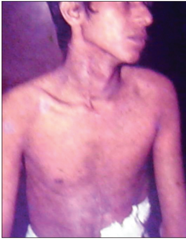
Figure 1: An 18-year-old patient with oesophageal stricture on feeding gastrostomy before reconstruction