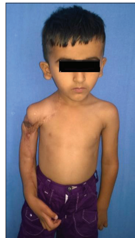
Figure 6: One year post-operative (frontal view)