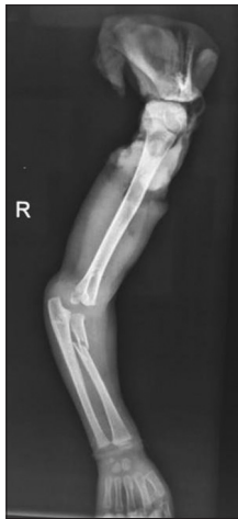
Figure 3: X-ray of the amputated part