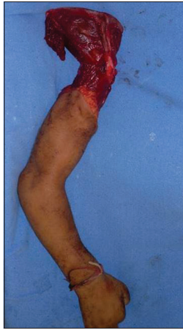
Figure 1: Amputated limb (dorsal aspect)