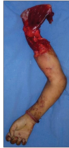
Figure 2: Amputated limb (ventral aspect)