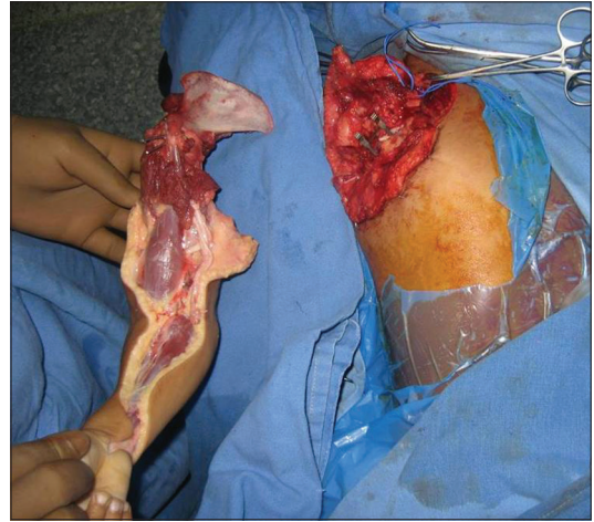
Figure 5: Amputated limb following fasciotomy and prepared amputation stump

day 27. The K-wires were removed on day 90 in the outpatient department, and the arm supported in a sling, and physiotherapy started [Figures 6 and 7]. The last follow-up at 18 months post-operative showed evidence