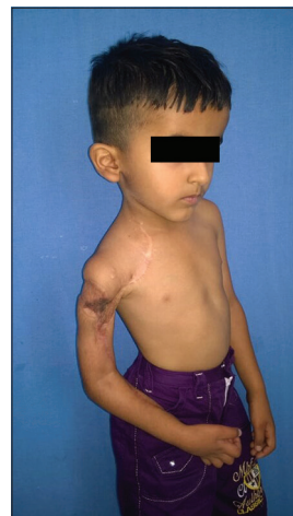
Figure 7: One year post-operative (oblique view)