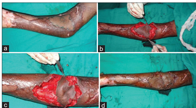
Figure 5: Intraoperative photograph of elbow contracture being released through subcutaneous propeller flap. (a) Intraoperative markings. (b) Raising the subcutaneous propeller flap. (c) Rotation of flap at 90°. (d) Surrounding skin covered with split thickness graft and the graft fixed in place

local fasciocutaneous flaps that may or may not include previously burned skin territories, radial, ulnar and posterior interosseous fasciocutaneous proximally-based flaps and reversed flow flaps such as the lateral arm and the ulnar recurrent upper-arm flap. [3,4] In addition, distant pedicle and microvascular transfer flaps are also being used. In all these flaps, the functional losses, cosmetic results and compromise of future reconstructive options