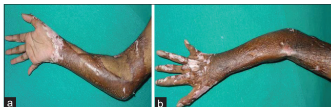
Figure 4: Pre-operative photograph of moderate degree (95°) of elbow contracture. (a) Ventral view. (b) Dorsal view