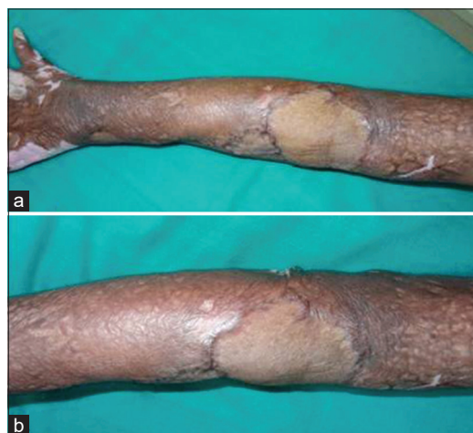
Figure 6: Post-operative photograph of elbow contracture showing 180° extension at the joint. (a) Distant view. (b) Close up view

should be taken into consideration while planning these surgeries.