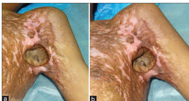
Figure 1: Pre-operative photograph of Type II axillary contracture (45° abduction) showing involvement of anterior and posterior axillary fold with sparing of hair bearing site. (a) Distant view. (b) Close-up focusing on hair bearing site