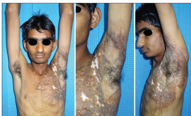
Figure 3: Post-operative photograph showing 180° abduction at shoulder joint which was maintained at 1 year with preservation of the hair bearing area