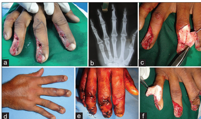
Figure 1: (a) Deep abrasion injury over the dorsum of index, middle, ring and little fingers with exposed distal inter-phalangeal joint of the middle, ring and little fingers with marking for the hatchet flap. (b) X-ray hand showing involvement of the distal inter-phalangeal joint more in ring and middle fingers. (c) The elevated hatchet flap over the middle finger. (d) Rotation flap elevated over the little finger and the closure of the hatchet flap over the middle finger. (e) Flap inset immediate post-operative. (f) 2 months post-operative result showing the well-settled hatchet and rotation flaps

Our patient is a 26-year-old man presented with deep abrasion over the palm in thenar eminence and the dorsum of index, middle, ring and little fingers over the distal and proximal phalanges. The injury over the ring, little and middle fingers had exposed distal inter-phalangeal joint [Figure 1a]. The injury over the index finger was not exposing the joint, and that was closed primarily. The distal inter-phalangeal joints of middle and ring fingers were destroyed with partial loss of head of the middle phalanges [Figure 1b] and these joints were arthrodesed and stabilised with 0.8 mm K-wires. The defect over the middle finger was closed with hatchet flap and the defects over the little and ring fingers were managed with rotation flap raised from the dorsum, based