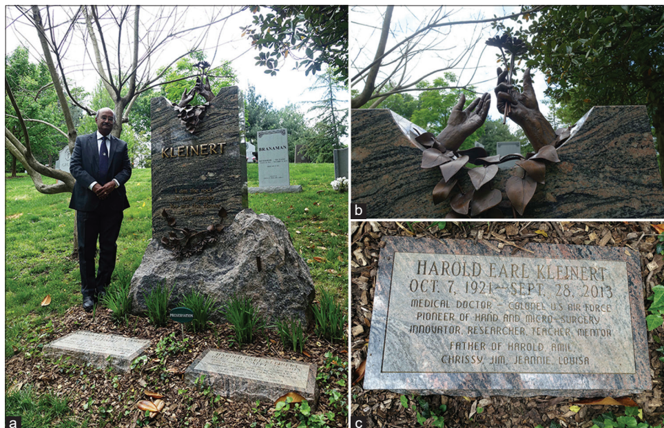
Figure 4a-c: The author paying respect at the cemetery and the inscription on the tombstone