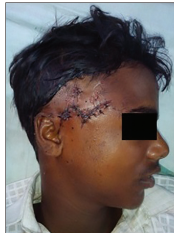
Figure 1: Sutured wound after ligation of superficial temporal artery

right temporal region with a hairline fracture to the right petrous temporal bone [Figure 3] and with superficial soft tissue swelling [Figure 2]. The patient was kept under observation and discharged on the 5 th day under satisfactory condition.